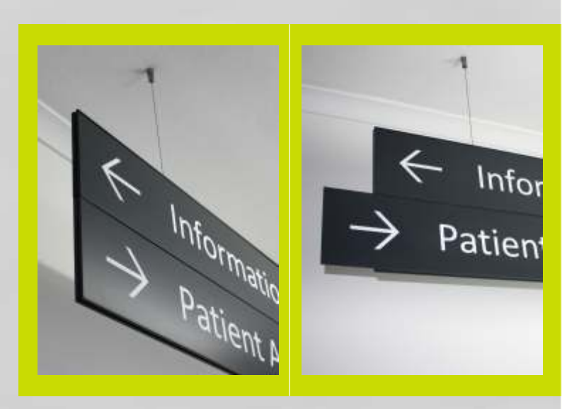
Suspended & Wall Mounted Sign System