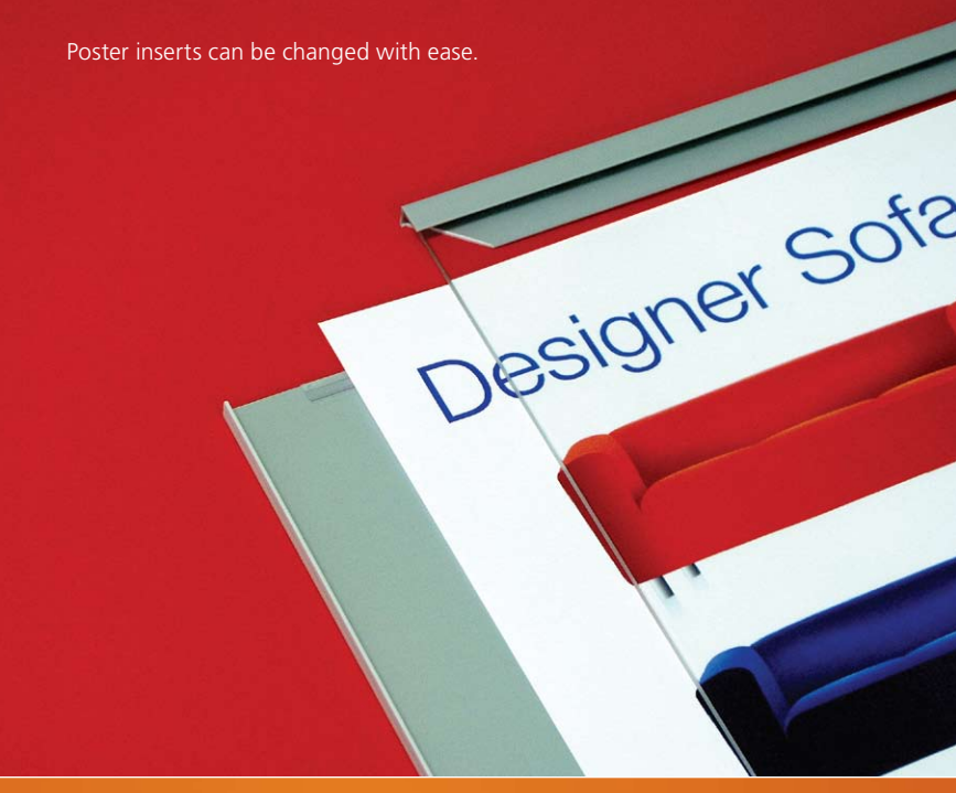
Poster Holders can be combined with the Systech Architectural Modular Series

If you require specific technical information or product details please contact Systech Signage Technology.