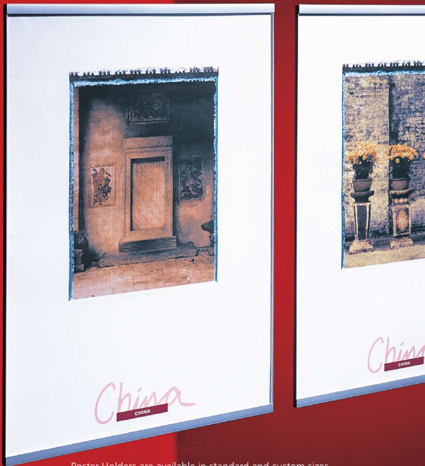
Poster Holders are available in standard and custom sizes.