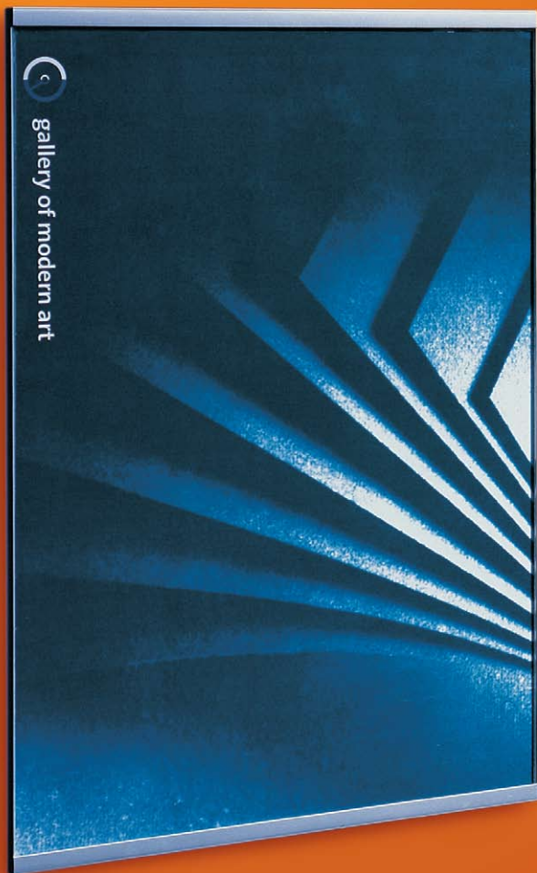
The clean-line design is perfect for interior applications.