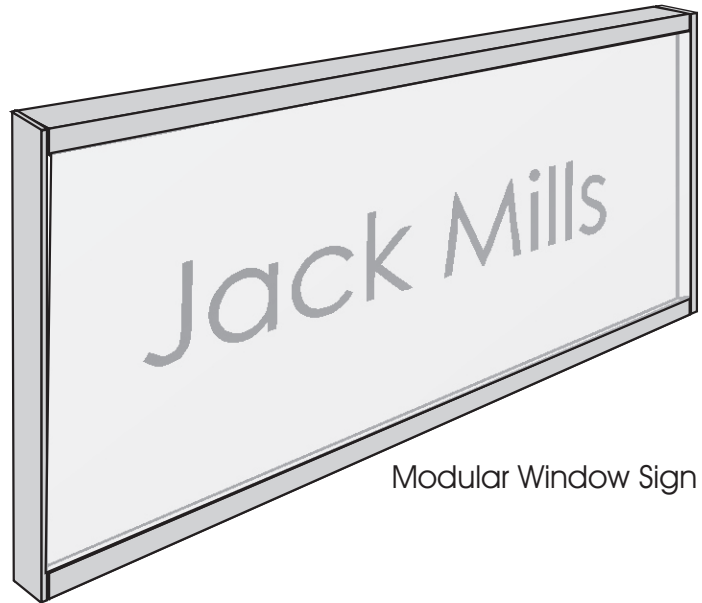
Modular Window Sign

The Modular Window Sign is available in various sizes, with or without an AM Series header or footer.